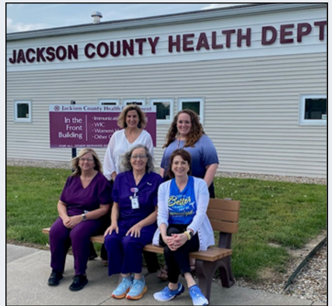
NURSES WEEK MAY 2023