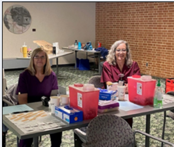
FLU VACCINATION CLINIC AT SIU IN OCTOBER