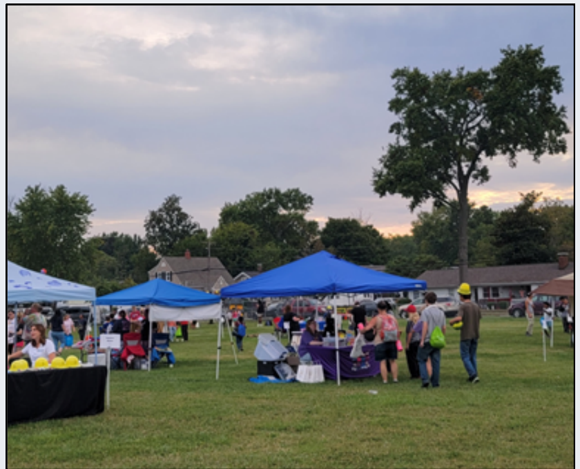
MURPHYSBORO COMMUNITY NIGHT OUT IN SEPTEMBER