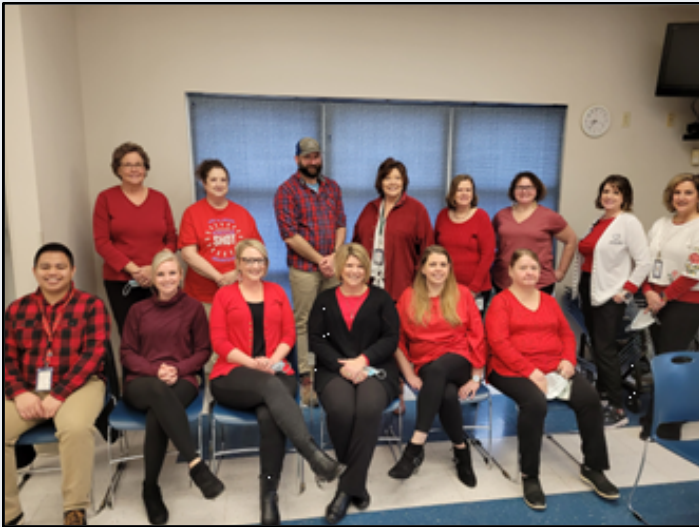
STAFF WORE RED IN FEBRUARY TO SUPPORT HEART HEALTH