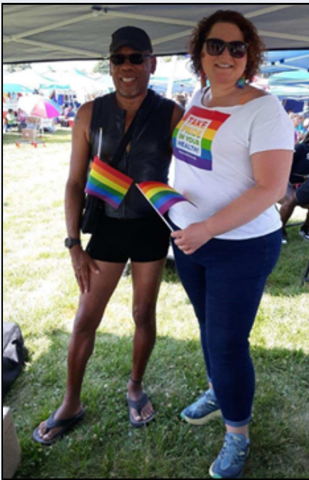
PRIDE MONTH CELEBRATION IN JUNE